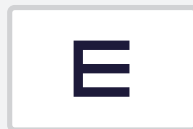
Visual Acuity Test